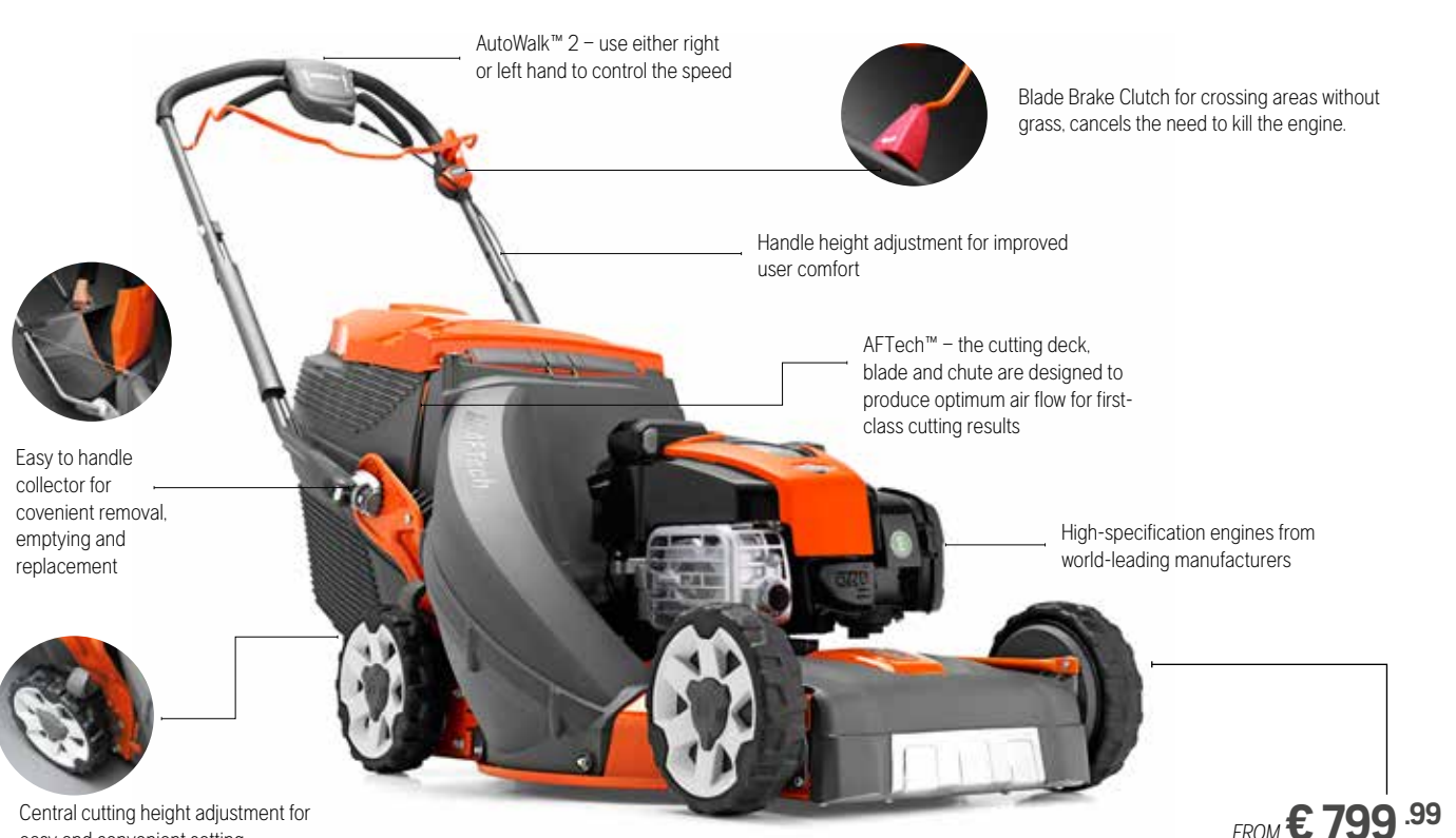
easy and convenient setting