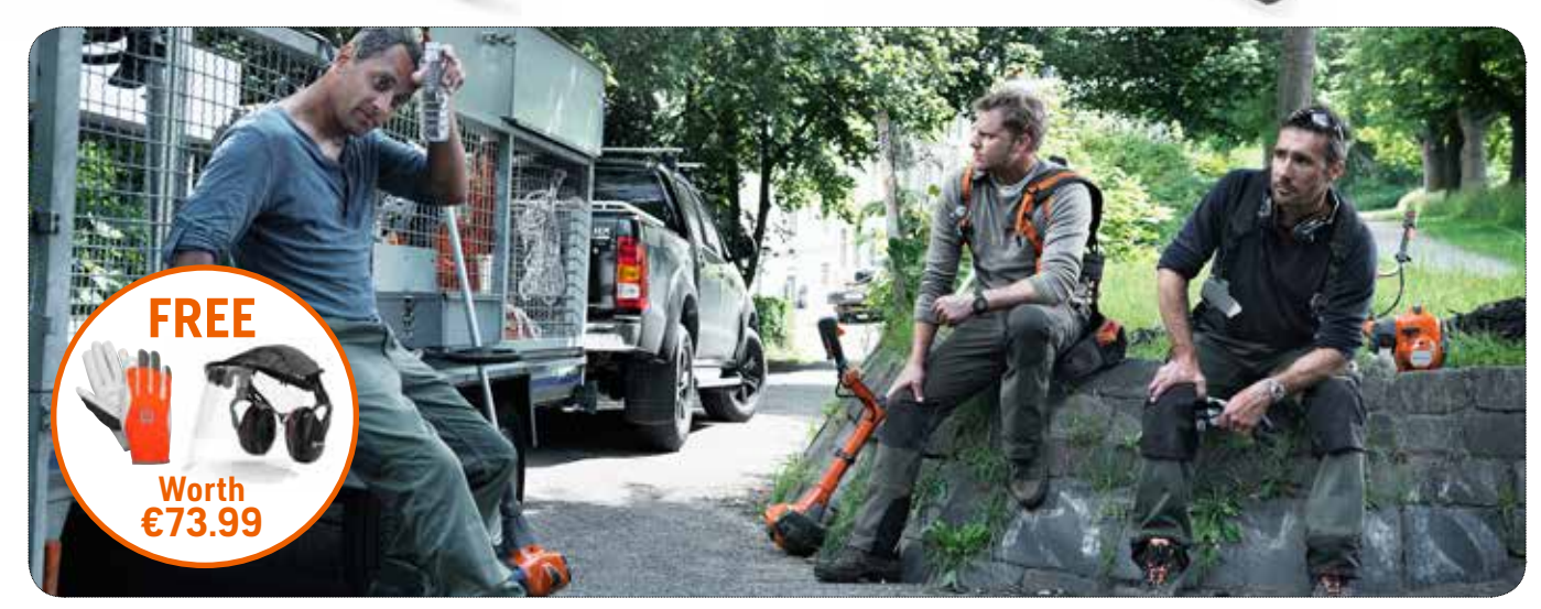
*Free Work Gloves worth €18.99 & Free Earmuff/Visor worth €54.99 with every 135R, 525rx, 543rs, 226HD75s & 122HD60 purchased during March-June or while stocks last.